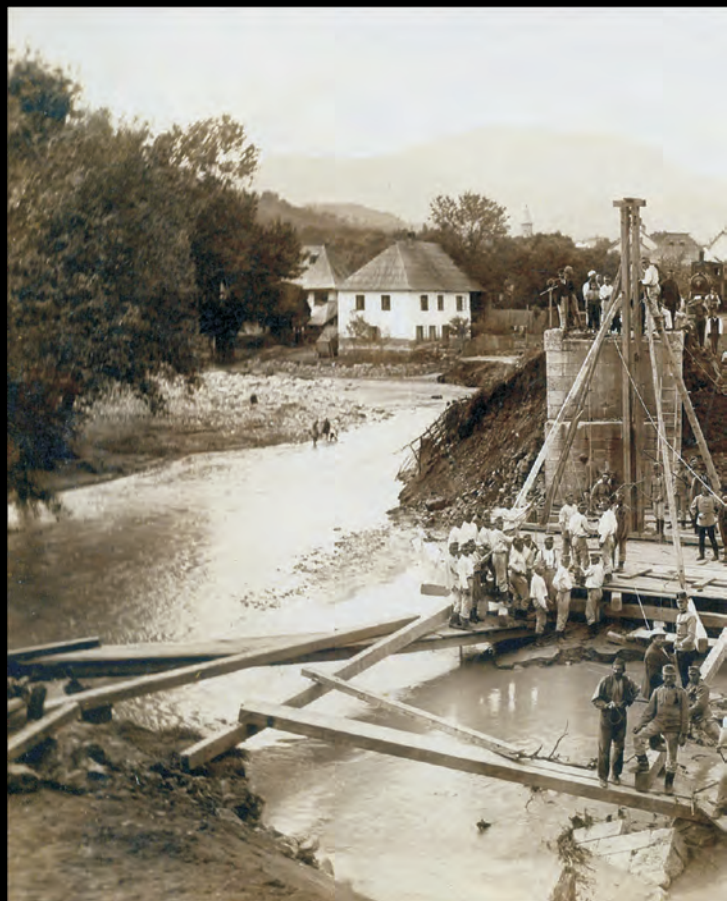
Photo from Józef Trajtler's album showing a railway in Bosnia and Herzegovina