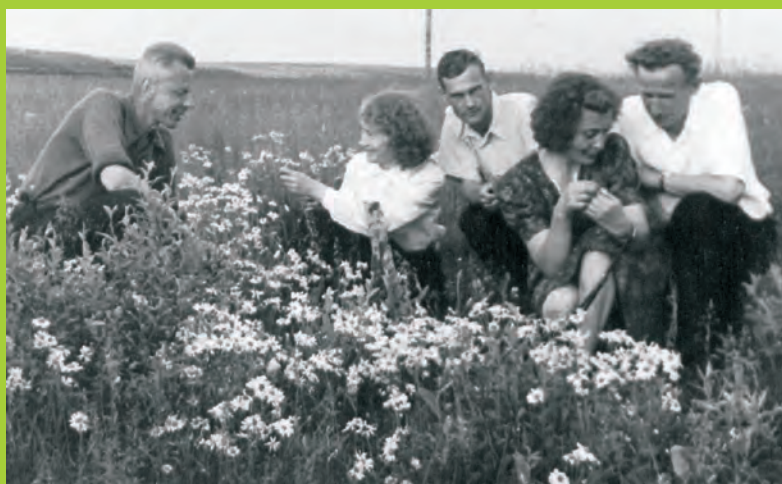
In Vorkuta.