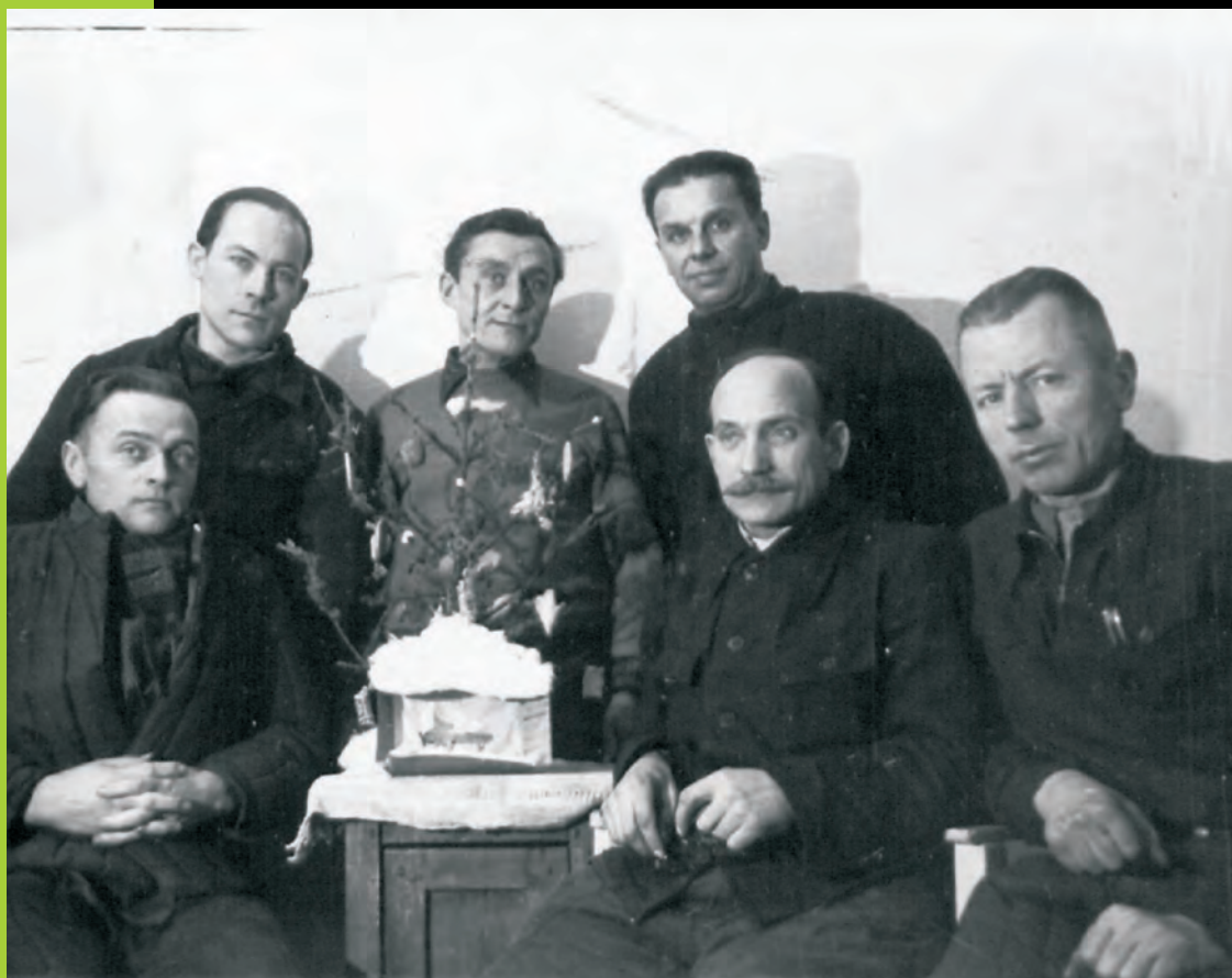
Vorkuta.