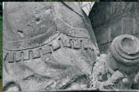
WACŁAW GÓRSKI'S COLLECTION