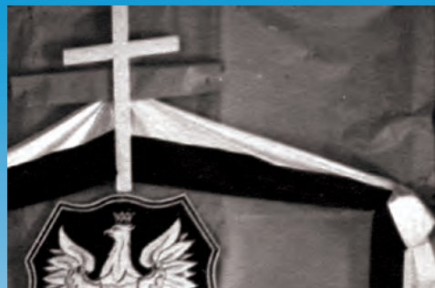
POLISH ÉMIGRÉ PUBLICATIONS