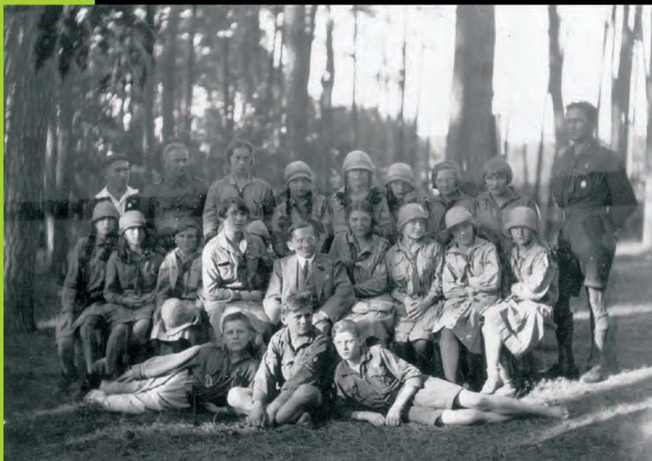
Trip to Wawel, 1954.