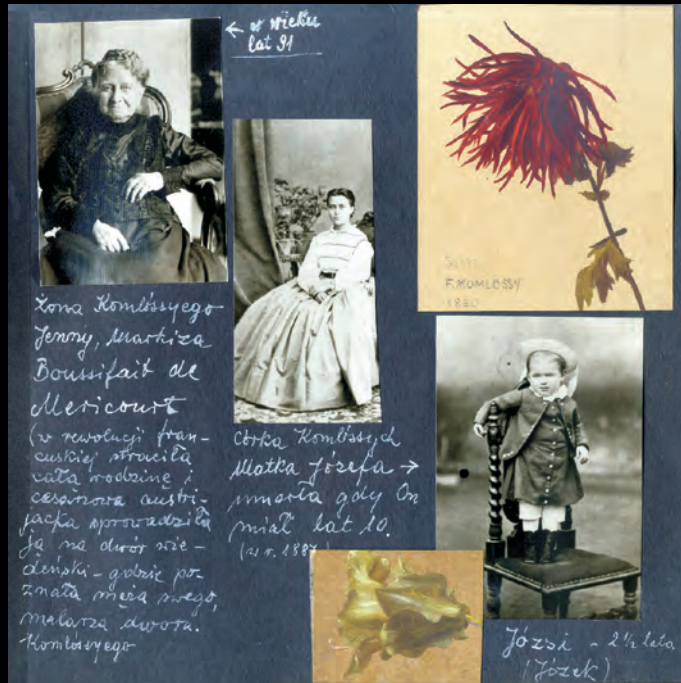
A page from the Trajtler family album

List of Poles returning home from Sarajevo in 1920