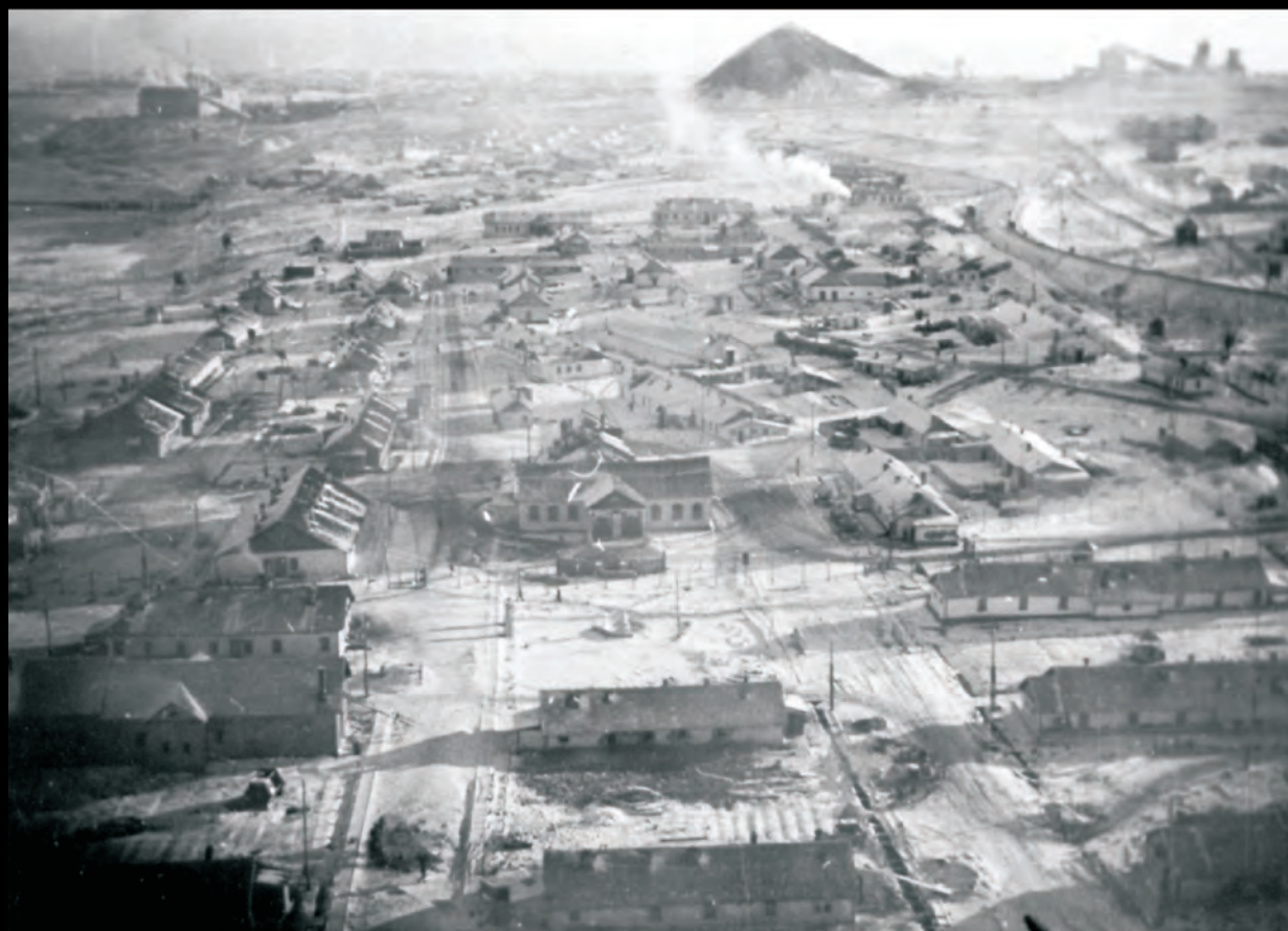
Labour camp in Vorkuta.