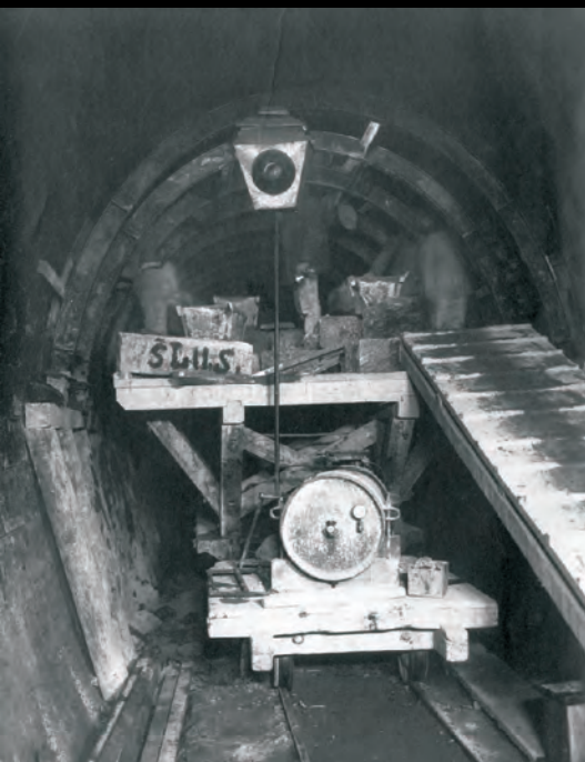
THE FAMILY ARCHIVE OF JÓZEF SZÜGYI TRAJTLER