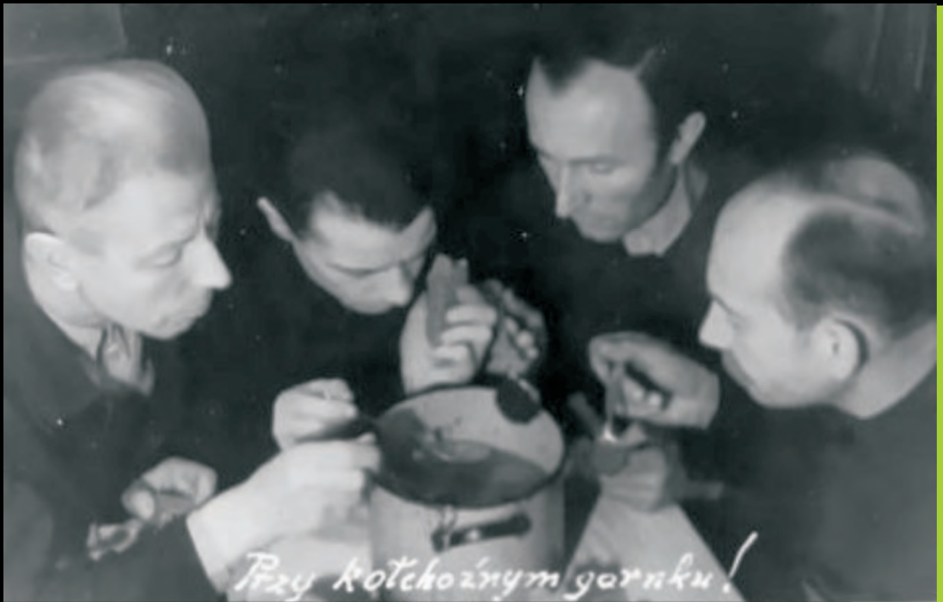
Beside the collective farm communal stew pot, Vorkuta.