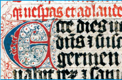
CULTURAL AND ACADEMIC HERITAGE