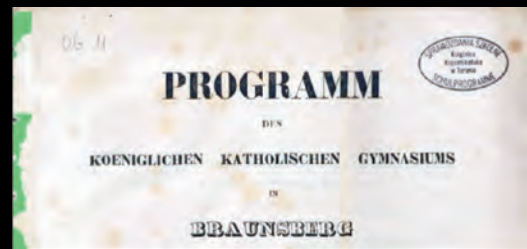
OFFICIAL SCHOOL INSPECTION REPORTS FROM THE 19 TH AND 20 TH C.