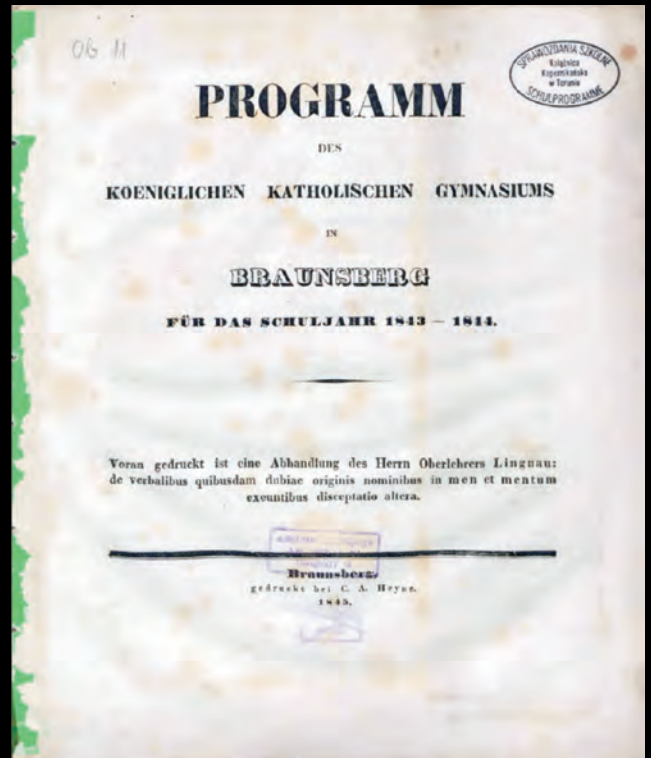
Programm des Koeniglichen Katolischen Gymnasiums in Braunsberg für das schuljahr 1843-1844. Braunsberg (Braniewo), 1845