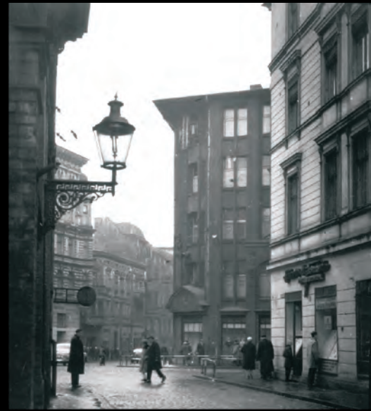
REMINISCENCES FROM BYDGOSZCZ INHABITANTS