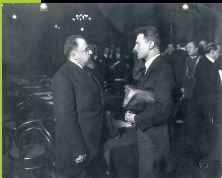
Riga Peace Conference – 18 March 1921. Adolf Joffe, head of the Soviet delegation (on the left) and Jan Dąbski, head the Polish delegation (on the right), greeting each other on the opening day of the conference