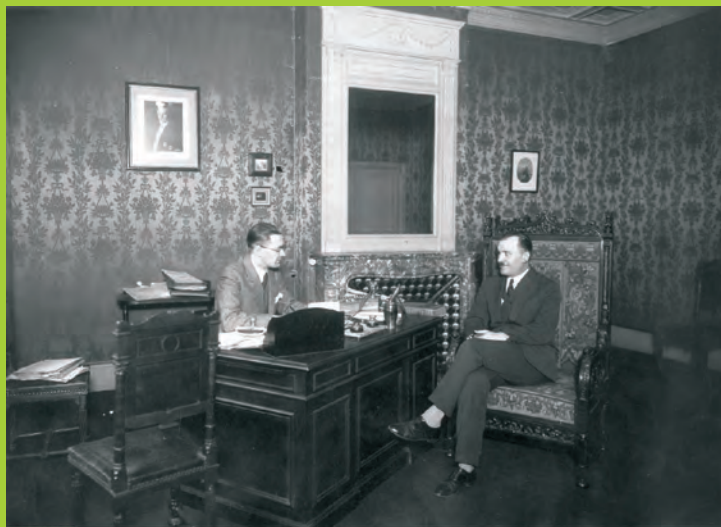
Consulate General of the Republic of Poland in Paris, 1928