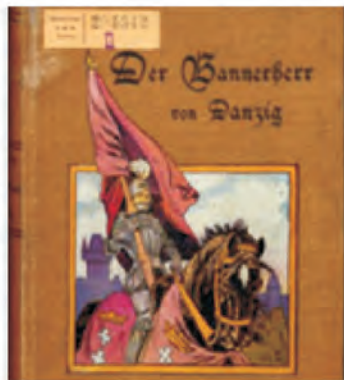
Books (before 1945)

COLLECTIONS subcollections | Collections (15)