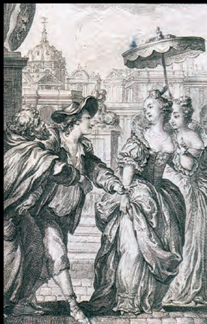
UKW'S SPECIAL COLLECTION