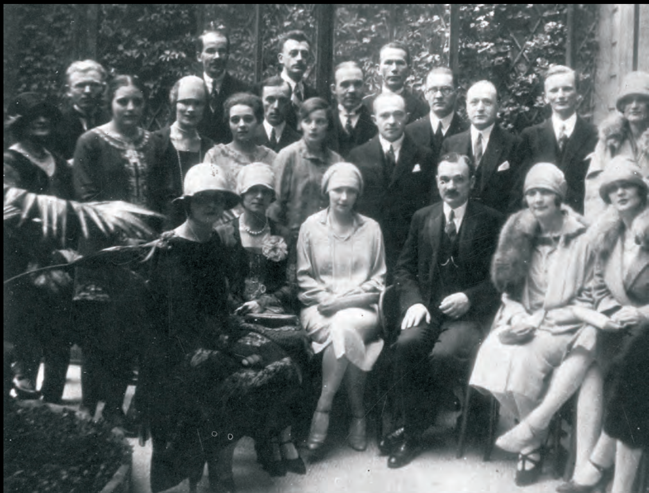
Employees of the General Consulate of the Republic of Poland in Paris with their wives, 1927