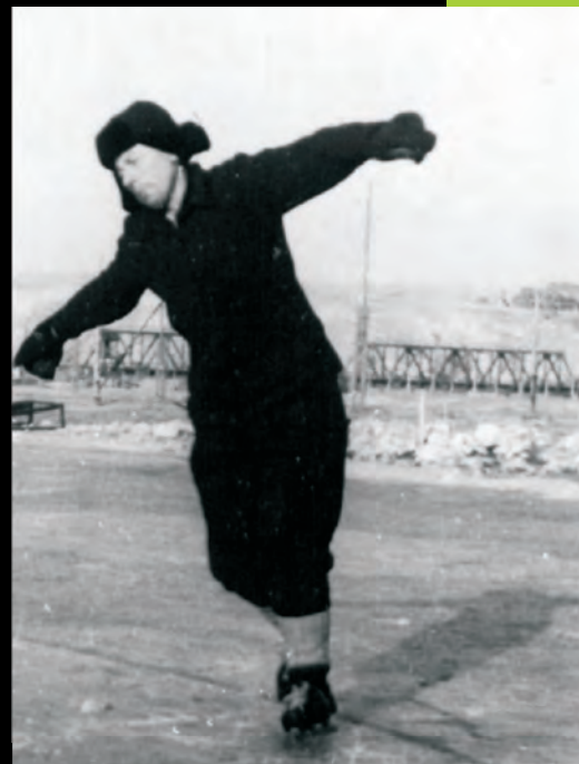
THE CULTURAL HERITAGE OF POLAND'S FORMER EASTERN BORDERLANDS THE UKW COLLECTION