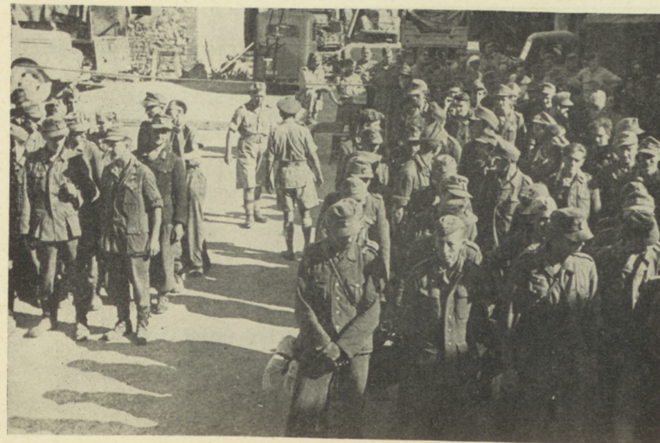
German prisoners taken by the Poles during the battle for Ancona, Italy.

Shortly before the capture of Pesaro, General Anders summed up the achievements of the Polish Second Corps to date: "Since June 15, we have captured or destroyed 14 tanks including Panther tanks, 55 heavy guns, eleven of which are self-propelled Hornets, 32 field guns, 97 anti-tank guns of different caliber, 3,170 prisoners and 2,500 dead Germans were found in the area taken by the Poles. The Second Polish Corps pushed forward a hundred and fifty miles, fighting seven major engagements: the river crossings of Chienti and Potenza, Mussore, the hills and town of Osimo and Ancona, the river crossings of Cesano and Metauro, reaching the Gothic Line. Owing to the destruction of roads, 2,000 mules carried supplies and our wounded had to be transported by plane. Polish engineers did a grand job building 54 bridges, removing mines and barricades, and filling up bomb craters. Though we have to face major engagements, we regard them as routine work. Our deepest concern is worry about the fate of heroic Warsaw."