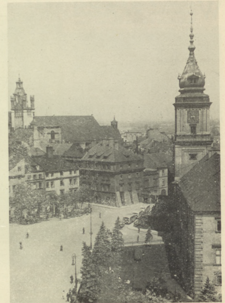
Castle Square in Warsaw as it looked before the German invasion of Poland.

Fighting and bleeding for Poland, for home!