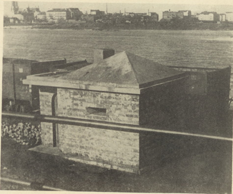
German strongpoint along the Vistula. Opposite is the Praga suburb, which was the goal of the Russian offensive.

* News of the final outcome of the latest Battle of Warsaw has not yet reached the United States as this issue of The Polish Review goes to press.