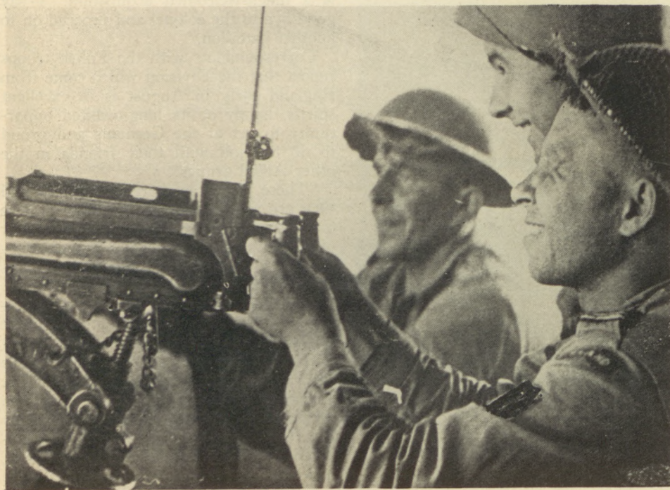
Polish heavy machine gun in action on the Italian front.

On the night of August 25 Polish troops began to cross the Metauro River