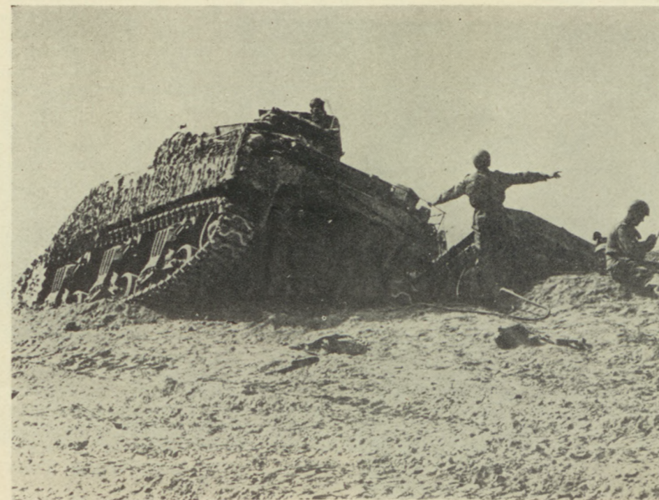
Polish tanks advance. France 1944.

French inhabitants of liberated towns. (Please turn to page 14)