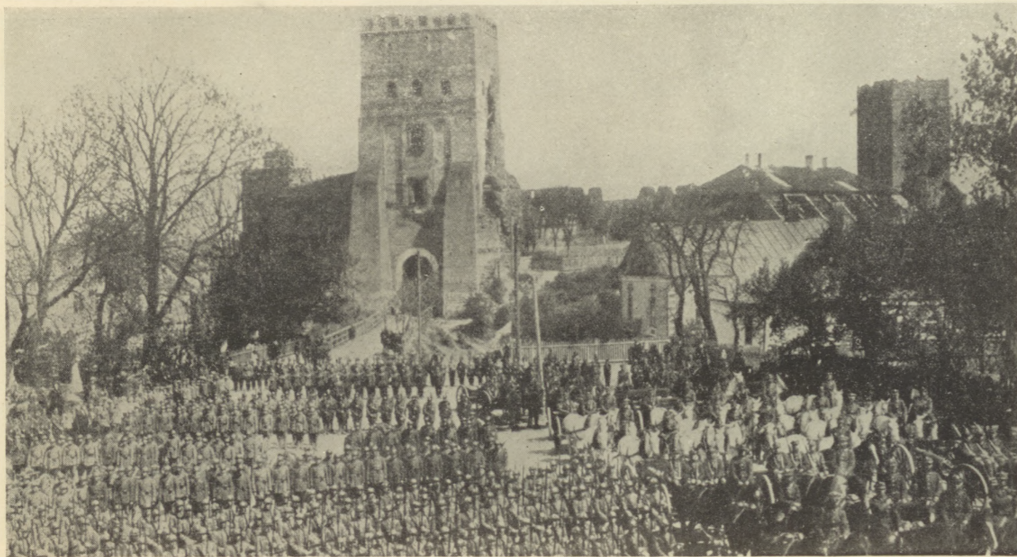
Polish military parade in Luck on the Polish national holiday, the Third of May.

MIDWAY between Lwow and Pinsk in southeastern Poland lies the ancient picturesque city of Luck. In prehistoric days it gave its name to the Slavic tribe Luczanie , and in the 11th century was the chief town of an independent principality. Across its fertile fields and winding rivers ran the great trade route from West to East, leading from Cracow, Lwow and Lublin to Kiev. Polish King Boleslaw the Bold won it in 1073. Later, Lithuanian dukes fought Ruthenian princes for it. Luck reverted to Poland in the 14th century. In the 15th century it was the seat of a bishop and had become wealthy and important. So important, in fact, that it was able to play host to a conference of monarchs. The Emperor Sigismund, King Jagiello of Poland, the King of Denmark, Wallachian and Muscovite princes, and Prussian potentates deliberated here in 1429 on the best methods of defense against Tatar invasions.