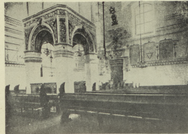
Jewish Synagogue in Luck.

Nor was the cultural life of Luck neglected. By 1937 its population had risen to 37,061 and to educate the youth of the city there were six nursery schools, fifteen elementary schools, four high schools and two trade schools. Eight libra-