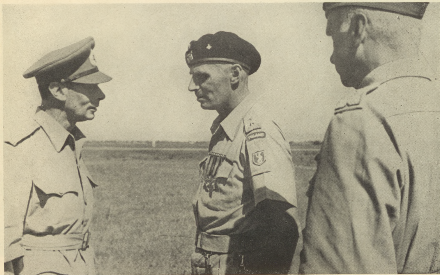
King George VI; Lt. General Anders, Commander of the Second Polish Army Corps; and General Sosnkowski, Polish Commander-in-Chief. Italy, July 1944.

ON August 31, Polish troops in Italy scored another notable victory by winning the ancient walled city of Pesaro, Adriatic seaport for the Papal States of Urbino and Pesaro. The Germans had turned Pesaro into an