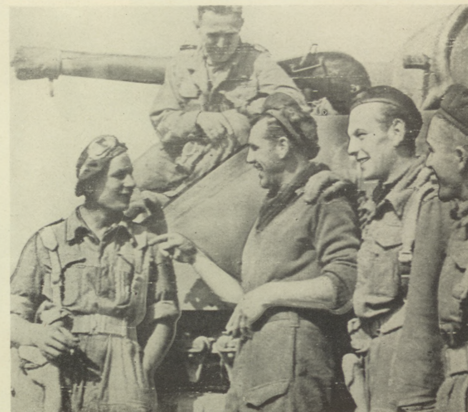
Polish tank crews relax after a battle in Normandy.