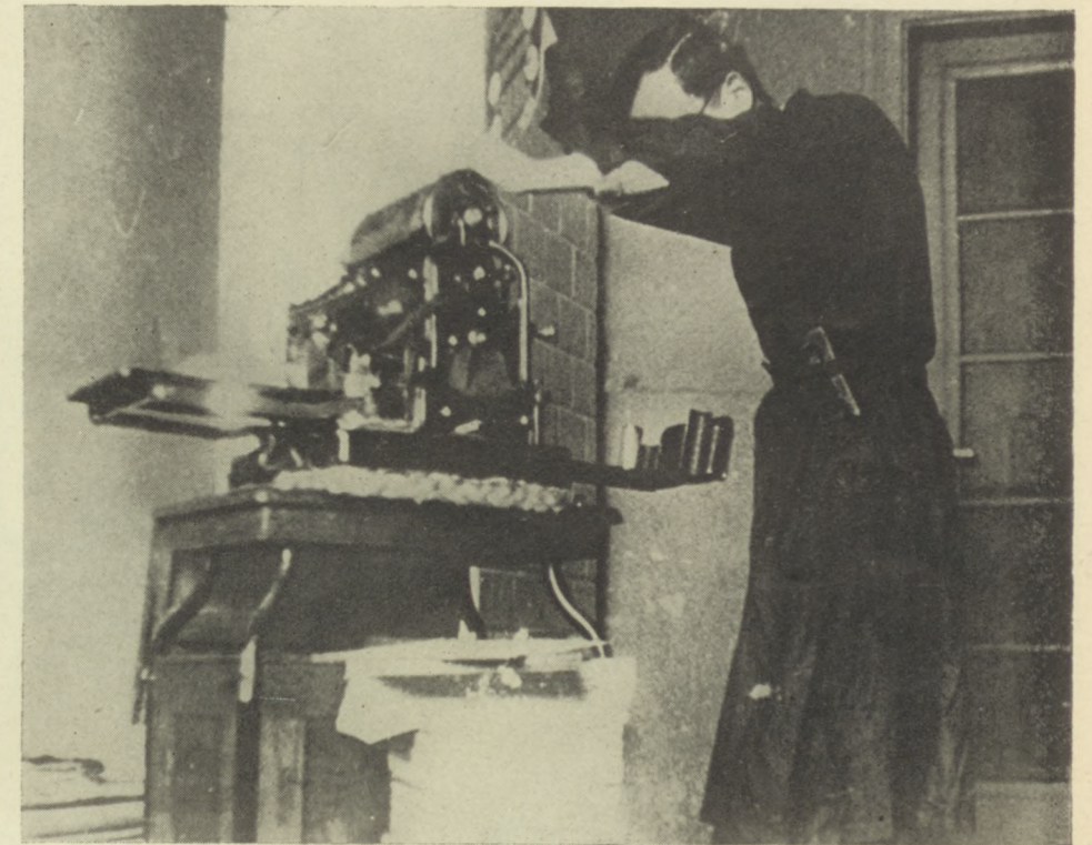
Printing an underground Polish newspaper. Half an hour later, this printer shot his way out of a Gestapo ambush.

Before fighting for the electrical power station began, 23 soldiers of the Polish Home Army were already there disguised as workers. According to an eye-witness account they were placed there to prepare plans of action for the expected