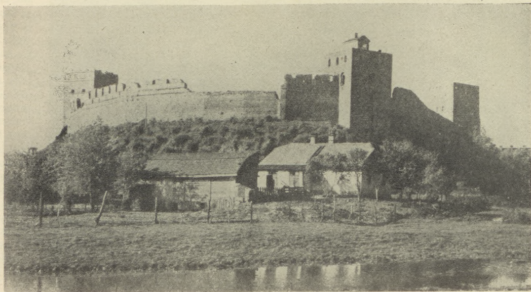
Lubart Castle in Luck.

of Luck's historic landmarks escaped the ravages of time and war. Ruins of old walls from the days Luck was a fortified town still stood in 1939. The oldest relic of by-gone centuries was the Lubart Castle, built in the 14th century. Situated high on a plateau, it dominated the region below, and its thick walls and three bastions were a reminder of its one-time impregnability. In free Poland the bastions were put to constructive use. One housed the tax collector's office, another the municipal archives and fire look-out post, while a third was outfitted as a chemistry and bacteriology laboratory. The inner building, erected in more recent times with stones from the ruined part of the Castle, was turned into a public school. Every year on the Polish national holiday of May 3rd, the