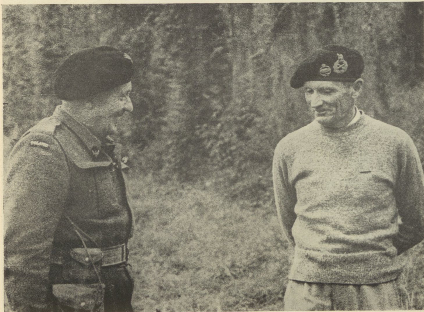
General Montgomery and Polish Commander General Maczek exchange impressions in Normandy, France.

S OLDIERS of the Polish Army based in the British Isles have been formed into an armored division that now fights with the Canadians, British and Americans for the "rocket-coast" of Normandy, the cities of Rouen and Le Havre, and has materially aided in the encirclement of Paris.