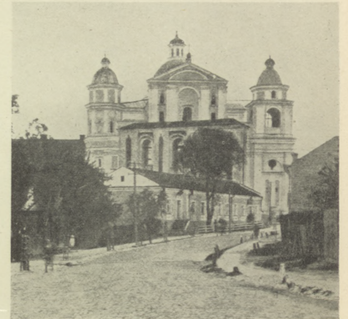
Catholic Cathedral in Luck.

ries provided books for relaxation and instruction, while the Volhynian Museum had established a fine reputation for itself. In a few short years, the city constructed an orphanage, homes for white collar workers, a hospital for contagious diseases, a municipal building and a "House of Polish Societies" boasting a large ballroom, reading room, library, restaurant and picture gallery.