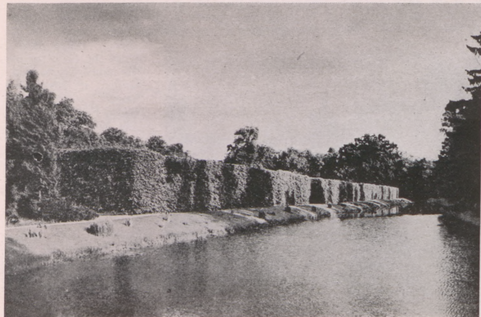
NIEBOROW—HEDGE AND CANAL

style be created by using, whenever possible, rare and beautifully shaped trees as main points of interest, instead of statues and architecture. As we have mentioned before, this "accent" on trees is both an expression of a national taste and has become a distinguishing characteristic of all Polish gardens,