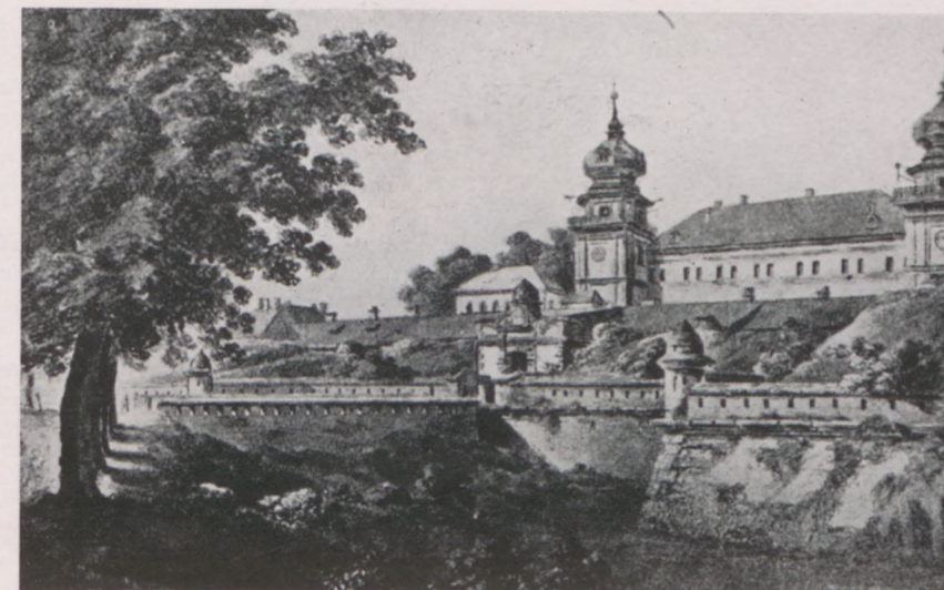
LANCUT CASTLE (18th Century) by THOMAS DE THOMOND