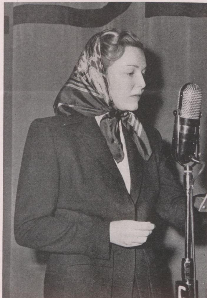
MADELEINE CARROLL AT THE MICROPHONE

JOSEPH—Good. It will not be easy for a woman. They will