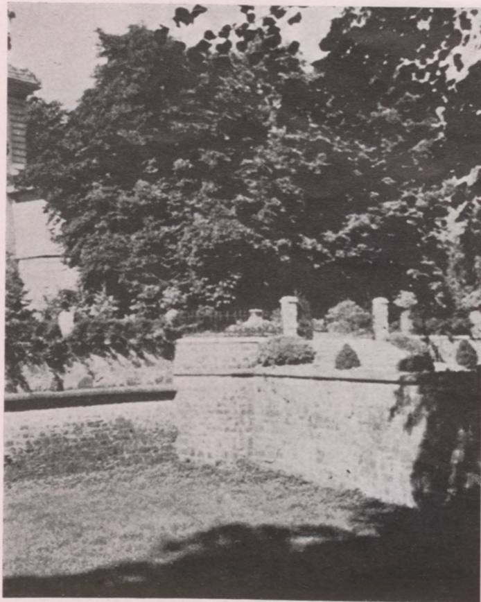
PARK AT LAN CUT

Pulawy was also the center of enthusiasm for the new "natural" school of garden art. At the time of its glory it was the most beautiful landscape park in Poland, and as such was sung by the French poet Delille in his poem "Les Jardins." The far-reaching influence that spread from Pulawy was a truly national garden art. It was Isabella's pet theory that Polish gardens should be distinguished by a bold use of decorative trees. She proposed that a distinct Polish garden