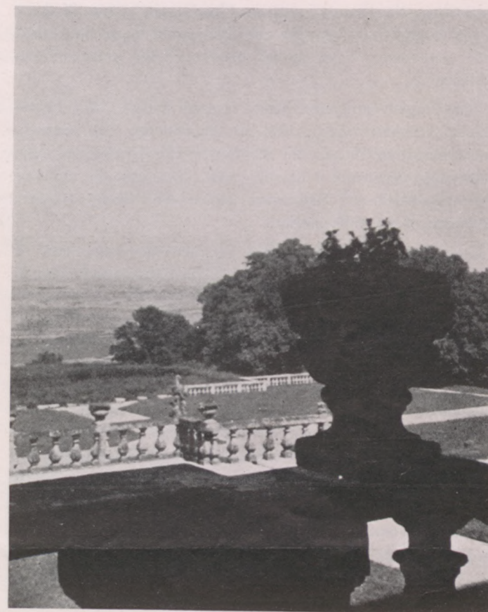
VIEW FROM UPPER TERRACE AT PODHORCE

Of the many typically French gardens, designed for Polish noblemen by Le Notre—the creator of Versailles—or his pupils, when in the 18th century French influence became predominant, few among them Posadowo in Poznania have been preserved in their original form. The latter part of the 18th century saw a sharp change in garden taste. The English picturesque landscape park became the rage.