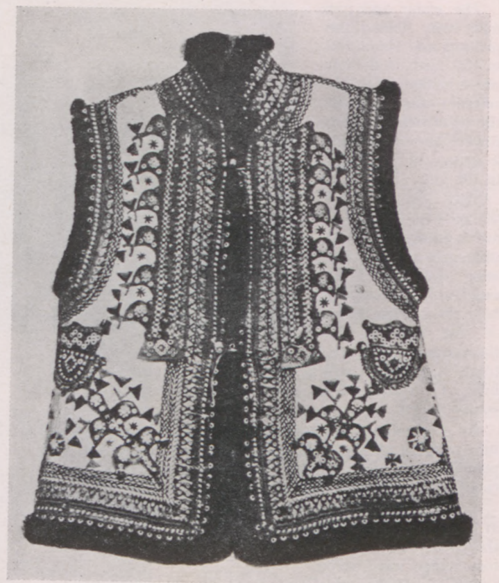
SHEEPSKIN JACKET MADE BY POLISH MOUNTAINEERS

Needless to say, the fur auction no longer exists in Wilno. Germany seizes the pelts for her soldiers who are dying on the Eastern front by the thousands. She is finding out that fur coats don't win wars. Warmth of spirit is more important than a warm garment, and the morale of the Reich is growing cold.