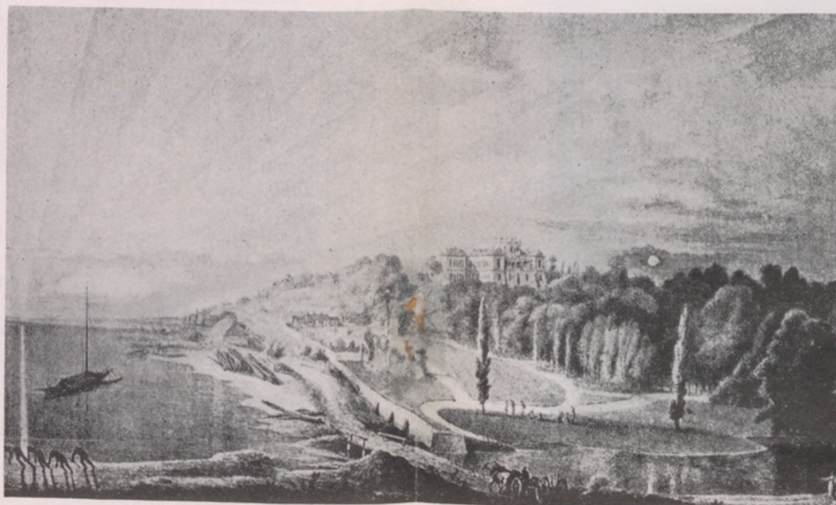
PARK AT PULAWY (18th Century) by J. P. NORBLIN

The gardens of Lancut consisted of a large English landscaped park, with a fine collection of rare trees extending beyond the boundaries of the castle grounds proper, and a number of small formal gardens within the grounds, encompassed by bastions and a deep moat in the form of a five-pointed star. These smaller gardens laid out at various times in the castle's history, among them a Rose Garden, a Spanish and an Italian garden, were all beautifully executed, and adorned with many charming architectural details and sculptures. But it was the fascinating pattern of the old moat, now clothed in green and edged with shady trees and banks of flowers, spanned with graceful bridges, and filled with a delightful play of shade and sunlight, that furnished the most distinctive adornment of the Lancut grounds, and held the memory of its romantic and dramatic past.