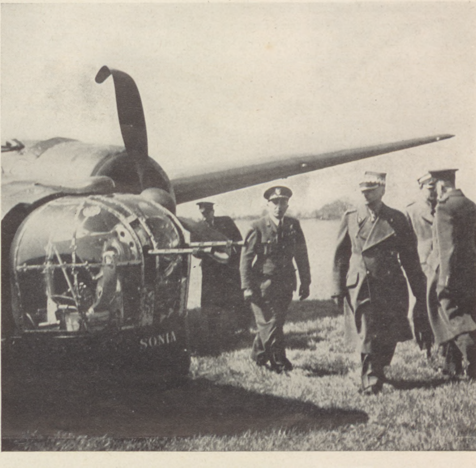
POLISH AIRCRAFT TAKE ACTIVE PART IN DESTROYING GERMAN MORALE General Sikorski inspecting Polish bomber after its return from raid on Rostock.

"At around eleven, the air raid sirens sounded and a moment later we heard the distant throb of English bombers. Will they find the city in the black-out? We were very nervous. But they found it easily and several light flares were followed by incendiaries. Night turned into day. Searchlights skipped over the sky and German artillery opened up. In reply, bombs rained down from above, exploding with terrific force in the most densely populated sections of the city. Like heavy ripe pears they fell on warehouses, on the synthetic rubber factory, on the electric power plant, on the pump station - everywhere. Fires broke out in rapid succession. From our vantage point at the top of a hill the burning city presented a fantastic spectacle. Maddened people were blindly running out of flaming shelters. The entire bombardment lasted about three quarters of an hour, and for two weeks thereafter the peculiar odor of charred wood was a welcome fragrance to us, stationed 20 kilometers from Karlsruhe!