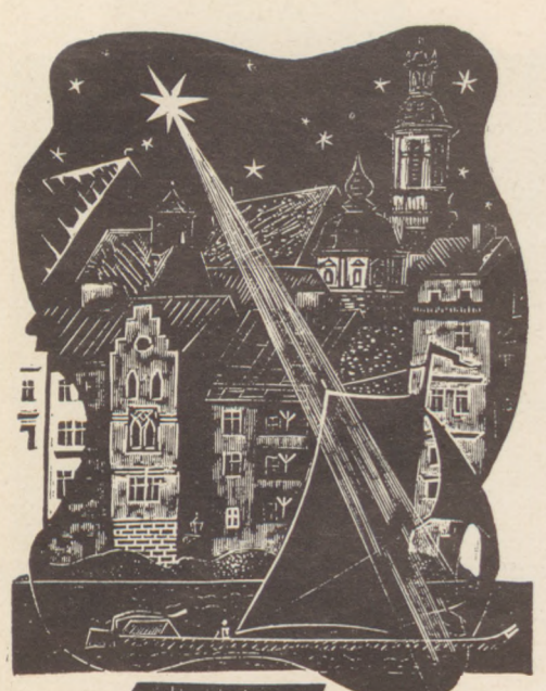
Woodcut by Tadeusz Cieslewski

THE Gospel with its manifold narratives of the birth, life, actions, and doctrines of Jesus Christ was for long centuries an inexhaustible source of inspiration for artists. They were irresistibly attraced, among other subjects, by the poetic scenes of the childhood of Jesus. None of the painters of the Middle Ages omitted such picturesque subjects as the "Nativi-