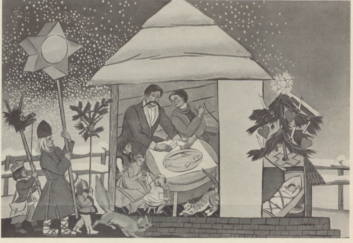
Painting by Zofia Stryjenska

eye — everything feels today, everything knows that the Lord is born.