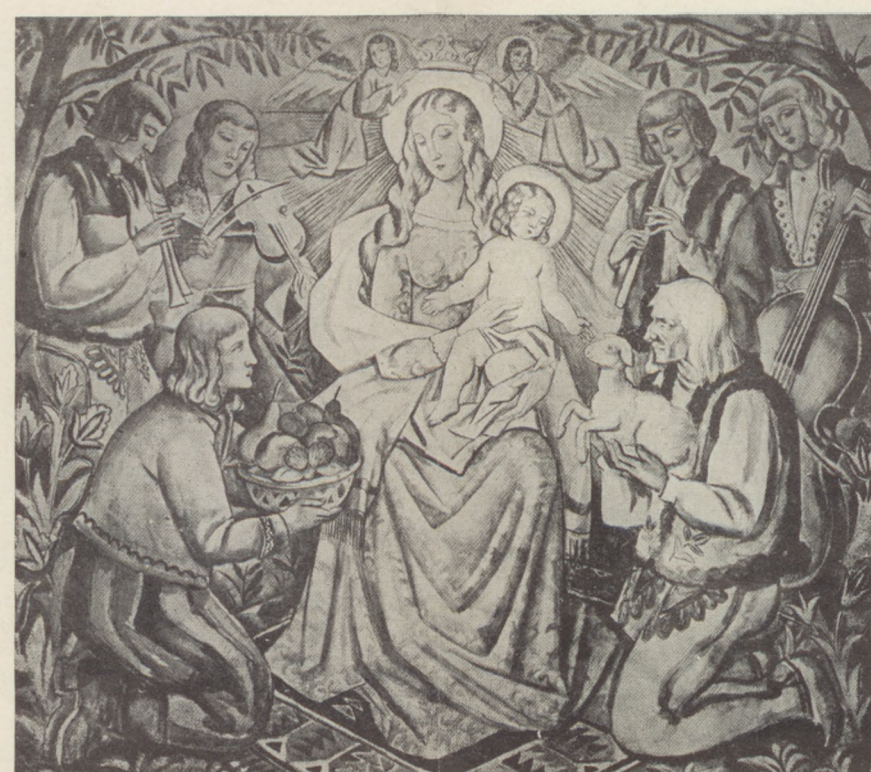
"ADORATION OF SHEPHERDS" by Wladyslaw Roguski

As regards the Mother of God, the problem of self-expression presented itself quite differently. The reverence of the Polish nation was responsible for the fact that the foreign custom, so common in Italy and in France, of endowing The Madonna with por-