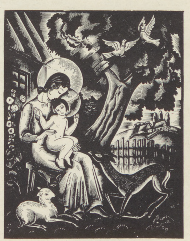
Woodcut by Stanislaw Ostoja-Chrostowski

But it is not astonishing that the Polish artists who, toward the end of the last and the beginning of the present century, sought to re-create the types, costumes, and customs of the peasant in their art, after a time "discovered" also the arts and crafts of the peasant, together with his painted and engraved holy images. Soon themes centering around the Nativity of Christ re-appeared in Polish paintting. Most interesting among these pictures the "Adoration of the Shepherds" represents a favorite subject of modern Polish religious art, each of the shepherds being clad in a peasant costume from a different part of Poland. At times even The Madonna is dressed in a peasant costume. Simultaneously some stylistic elements as regards color and design, have been introduced into these paintings. And it was the great Polish woman artist, Zofja Stryjeńska, who with marvelous creative genius succeeded in her works to fuse traditional native elements with the general