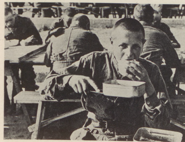
A SQUARE MEAL