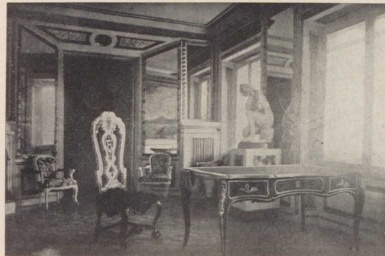
KING STANISLAUS AUGUSTUS' STUDY

The Palace is a two-story edifice, rather small as palaces go, but extremely homelike. Because of frequent changes made in its early period, its decoration ranges from baroque, rococo, Louis XVI to the classicism peculiar to Stanislaus Augustus. These styles