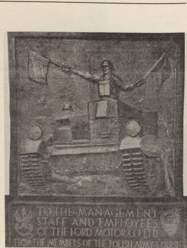
Bronze tablet presented by a group of Polish army engineers and technicians in appreciation of the cordiality and good will shown them during their training period in the Ford motor plant in England.

Some idea of the repressive measures applied against them can be gained from their fate in the Kielce district: 14 have been executed, 28 have died in concentration camps, 79 more are still in camps, one is in prison, all trace has been lost of four others, and 23 have been dismissed from their posts.