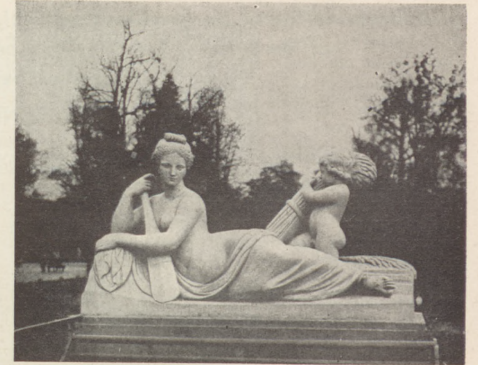
"VISTULA" — STATUE

The open air amphitheatre deserves mention because of its unique character, combining romanticism with classicism. The miniature stage on an island in the lake is framed by Grecian ruins and trees. Above the semi-circle of stone seats on the shore facing the island to which it is connected by a drawbridge, tower the seated statues of Tragedy,