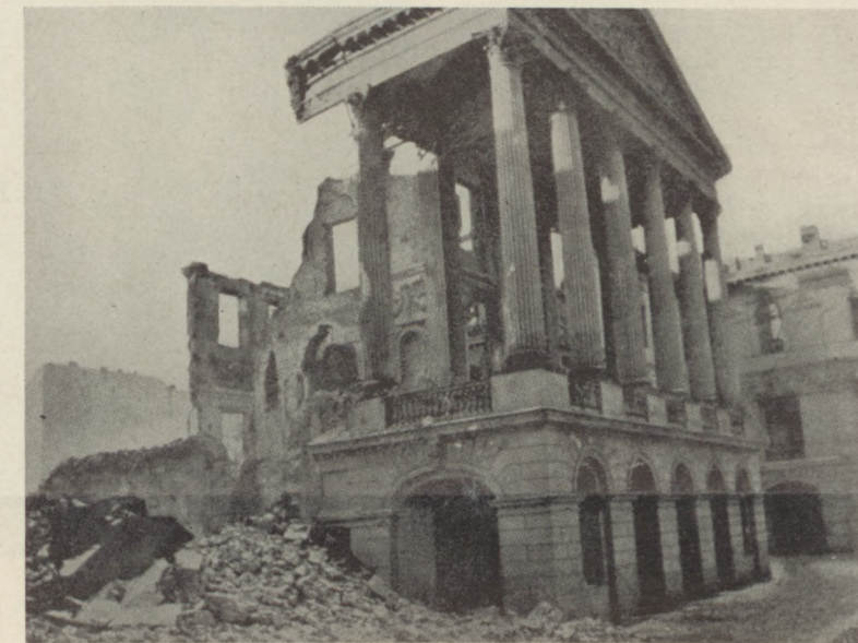
MINISTRY OF TREASURY IN WARSAW