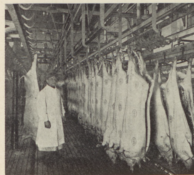
HOGS SLAUGHTERED FOR BACON

In 1939 there were forty-eight modern packing plants in operation in Poland. The development of the packing industry brought in its wake a lively export trade in preserves. Thus, Poland exported meat (pork, veal, mutton, and horseflesh), poultry of all kinds, bacon, gammons, rib-backs, etc., pickled meat products, pickled hams, cured pork loins and butts (unpacked and in air-tight containers), cured hams in tins, tinned picnics after the American style of packing, chopped ham in tins (luncheon-meat), beef goulash, pressed veal in tins, poultry preserves, refined and unrefined lard. Exported in small quantities were sausages, roast meats, meat pastes, and Lithuanian-type cured meats and sausages — famed for their excellent taste and great keeping qualities.