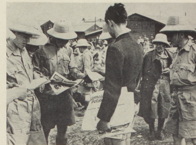
THE ARMY'S THIRST FOR NEWS