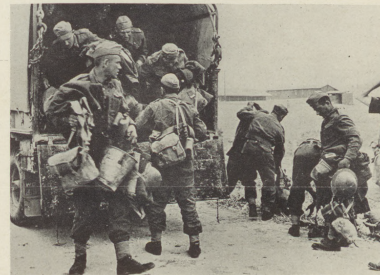
THE LONG, LONG TRAIL