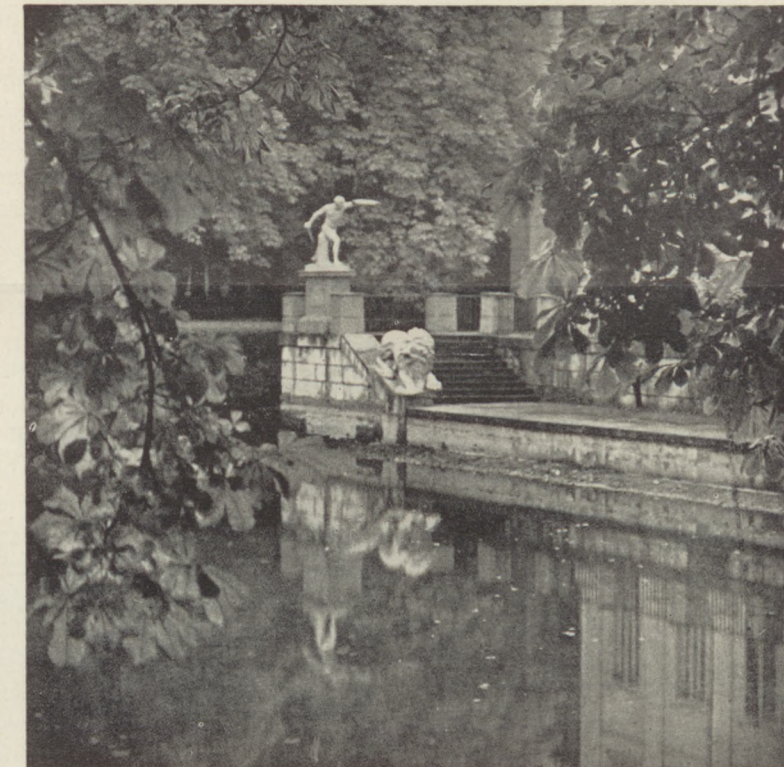
LAZIENKI — PARK

Comedy and "the sixteen great dramatists of the world". It is interesting to note that in 1793 King Stanislaus Augustus made up the list as follows: Aeschyles, Euripides, Sophocles, Aristophanes, Menander, Plautus, Terence, Seneca, Shakespeare, Calderon, Racine, Moliere, Metastasio, Lessing, Trembecki, Niemcewicz.