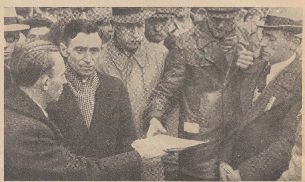
Over ten and a half million acres of land have been handed over to the peasants