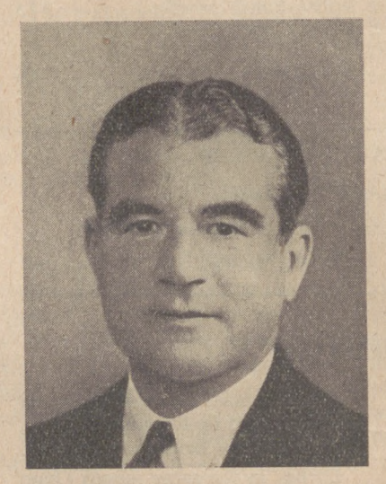
FRANK BOWLES, M.P. (Member for Nuneaton) Vice-Chairman of the Parliamentary Labour Party

There is, quite naturally, a keen desire in Poland for the return of Poles at present in Britain. I am convinced that the majority of Pobe warmly welcomed at homeeven if only for the reason that Ladek-Zdroj (Landeck).