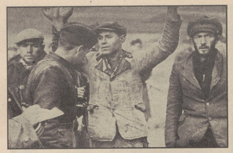
The game is up. Once an army, now just bandits and killers.

Other documents described the collaboration of UPA with the Polish underground organizations. NSZ and WIN. There was, for instance, the appeal sent to UPA by Zubry, leader of an NSZ detachment, who lamented that fights with Polish troops had reduced his following to eight men and asked UPA for reinforcements; or the account of the joint burning of the village of