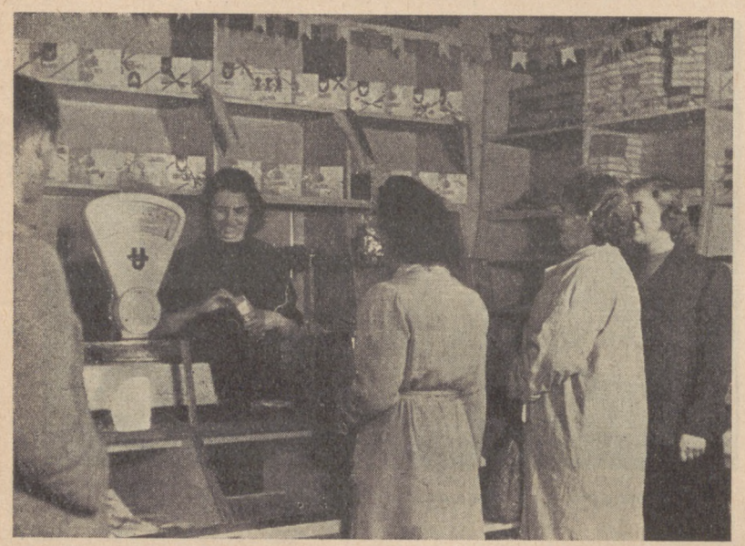
A Co-operative chocolate shop at Lodz.