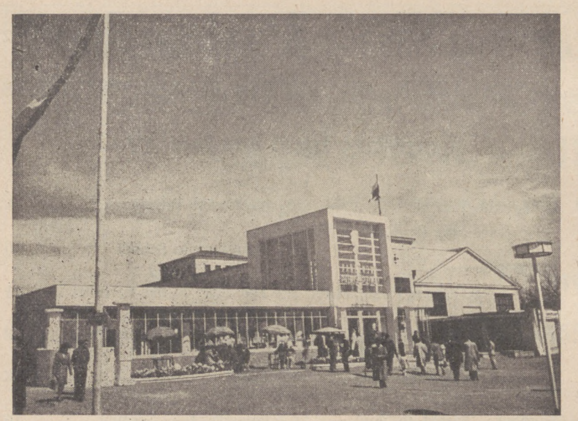
Poznan Fair demonstrated Poland's desire for trade.