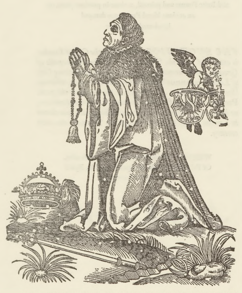
DEI GENETRIX CLAROMONTANA, REGINA REGNI POLONIÆ, DEFENDE POPULUM TUUM!

"Sweet Themmes! run softlie, till I end my Song."