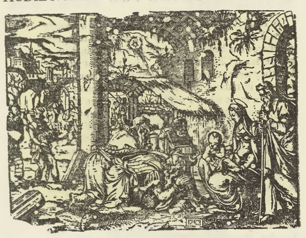
GENUIT PUERPERA REGEM CUI NOMENAETERNUM ET GAUDIA MATRIS HABENS CUM VIRGINITA TIS HONORE: NEC PRIMAM SIMILEM VISA EST NEC HABERE SEQUENTEM: ALLELUJA (ANTIPHONA)